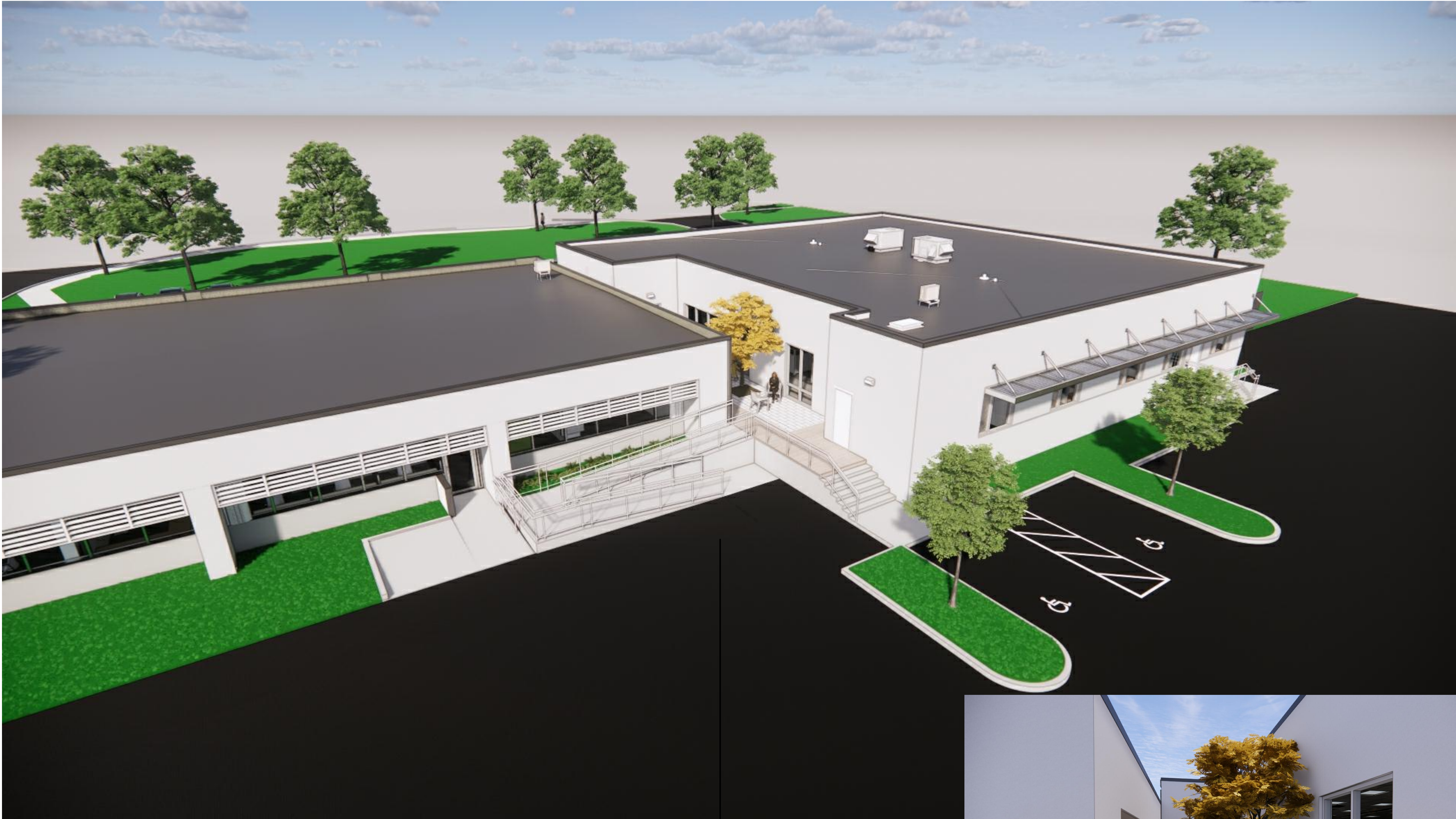
1 A4.1 EXTERIOR PERSPECTIVE #4 N.T.S.